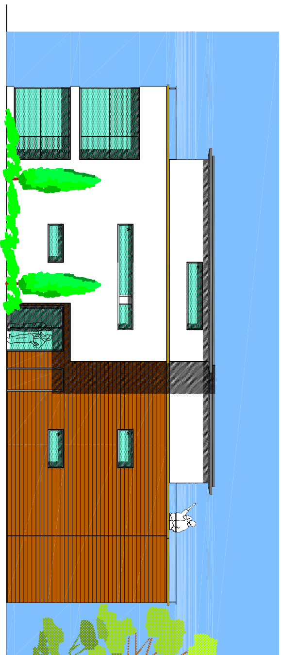
01 EAST ELEVATION SCALE: 1:100